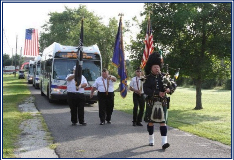
Members of the Pine Hill American Legion Post 287 Honor Guard, led by a single bagpiper, escort the first wave of buses carrying wounded Veterans.